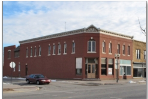
Shay Building Sterling, Kansas

Built in about 1881, just five years after the City was incorporated, the two-story brick Shay Building is an example of late 19th-century vernacular commercial styling. It was an early focus of business activity in Sterling, and is the only original building still remaining on what was historically Sterling's most important intersection.