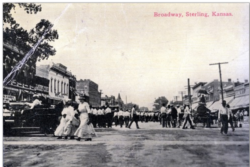
Broadway Avenue in Sterling

It was on March 3, 1863, that President Abraham Lincoln signed the railroad land-grant bill that would eventually give three million acres of land to the then budding Atchison, Topeka and Santa Fe Railway. With a stroke of his pen the President opened up a whole new section of the west, making possible such pioneer settlements as Sterling and its forerunner, the tiny Quaker village of Peace.