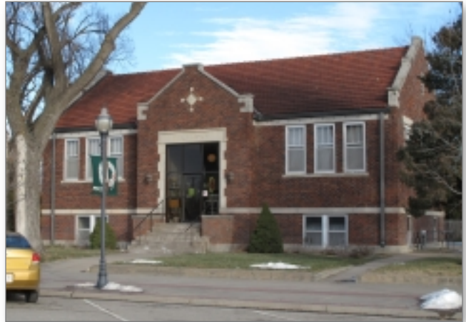
Sterling Free Public Library (a Carnegie Library) Sterling, Kansas