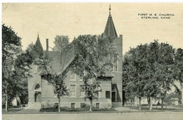
First United Methodist Church — 1921

Other buildings in the community may have the potential for listing on the National Register, should their owners ever decide to pursue such recognition. The First United Methodist Church, on the southwest corner of Broadway and Jefferson, is one example of such a building. It was originally constructed in 1901; an addition was added in 1932. In 1991, that addition was removed and replaced with a new addition, and the basement was filled in. The main portion of the church still retains enough historical integrity that it may qualify for listing.