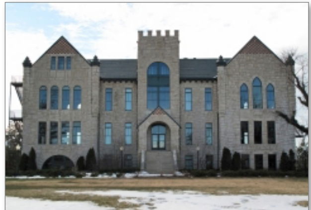
Cooper Hall Sterling College

The three-story Gothic-influenced building is still used as the College administration building and for classrooms. A focal point on the campus and a landmark in Sterling, it was listed in the National Register in 1974.