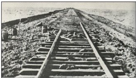
Tracks' end, near Hutchinson, 1872

As in most pioneer towns, the majority of the original buildings were one-story frame structures with false fronts. Sterling lost some twenty of these buildings in four major fires in the years 1880 to 1882. Three of the conflagrations were on Broadway, between Main Street and the railroad tracks.