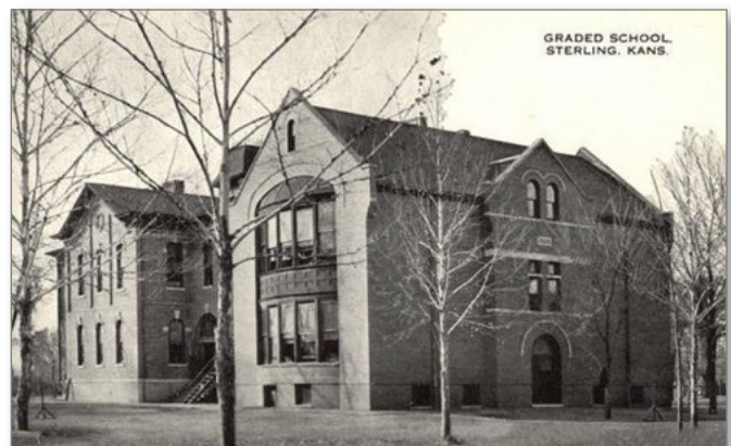
Sterling Grade School