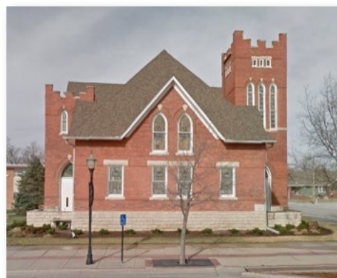
First United Methodist Church — 2015